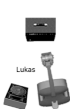
Contrabass: - 1 x Line out Pickup - Bass Amp

“Corin Curschellas & The Recyclers Reloaded”