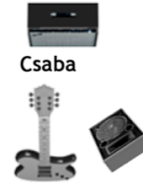
Guitar: - Electric Guitar Amp