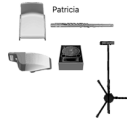
Accordion/Variety Flutes - brings Accordion Mics (2 x Jack out)