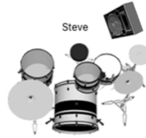
Drumset: - 1 BD (supplied) 1 Snr Mic - 1 OH Mic (supplied) - 2 tom mics (supplied)