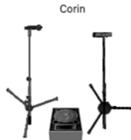
Vocals: - 2 SM58 on Boom Stands